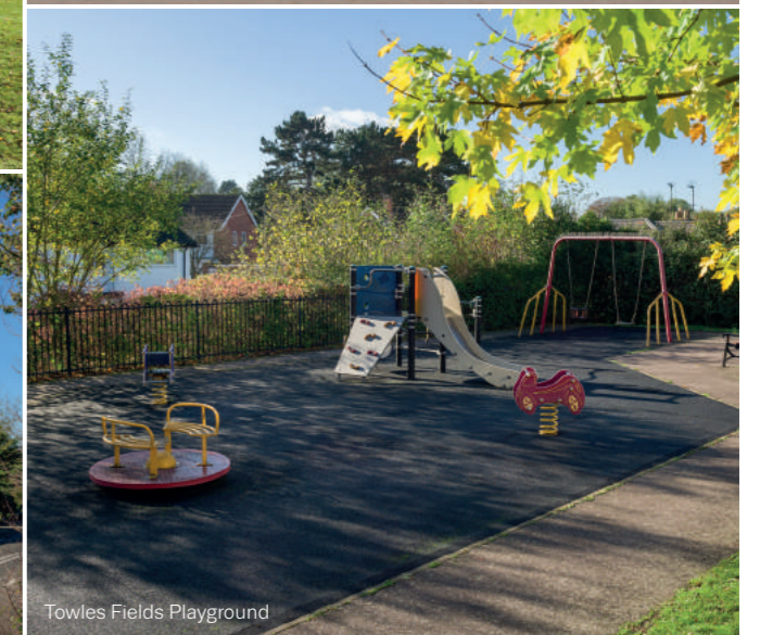
Towles Fields Playground

Our stunning new development consists of 70 plots that offer an excellent choice of 2-5-bedroom homes, all beautifully designed inside and out.