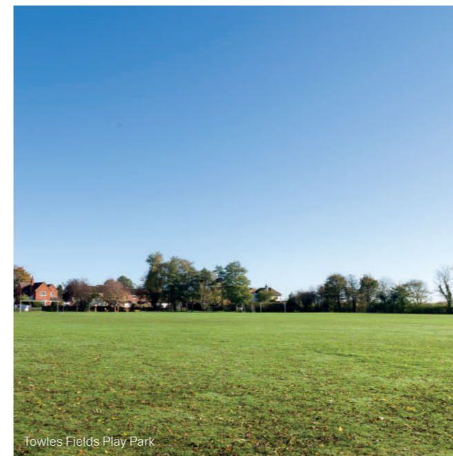
Towles Fields Play Park

Burton on the Wolds has something for everyone, with plenty to see and do right on your doorstep. From schools, nurseries and churches to cafes, restaurants, salons and barbers, most of life's essentials are all within a 10-minute drive of your new home. So, whether you're a couple, growing family or looking to downsize to a more peaceful location, there is something for everyone at Honeysuckle Rise.