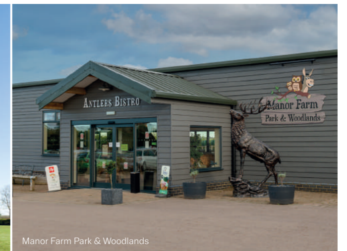
Manor Farm Park & Woodlands