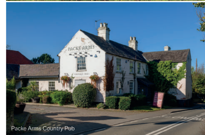
Packe Arms Country Pub