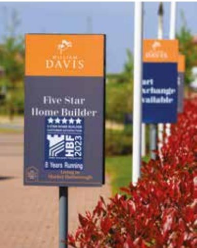
We've achieved HBF 5-Star status eight years in a row. Well done everyone!

We've also had success in our 'offsite' pursuits. Last year we won Nottingham's Dragon Boat Race, and just recently came 1st and 2nd in this year's event with what was a very tight finish – read the report and see what others have been up to on pages 38 and 39. While 32 members of our team – from all areas of the business – undertook the Yorkshire Three Peaks Challenge, raising an incredible £5k for The Myton Hospice – see page 35.