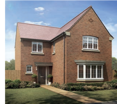
The Soar 4-bedroom detached home