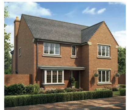
The Seaton 4-bedroom detached home