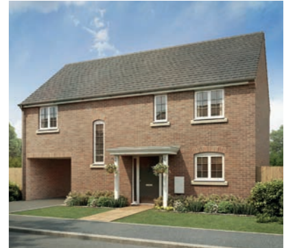
The Rannoch 4-bedroom home