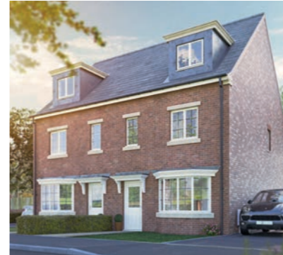
The Solway 3-bedroom home