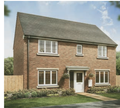
The Solent 4-bedroom detached home