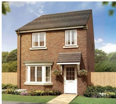
The Lea 3-bedroom home