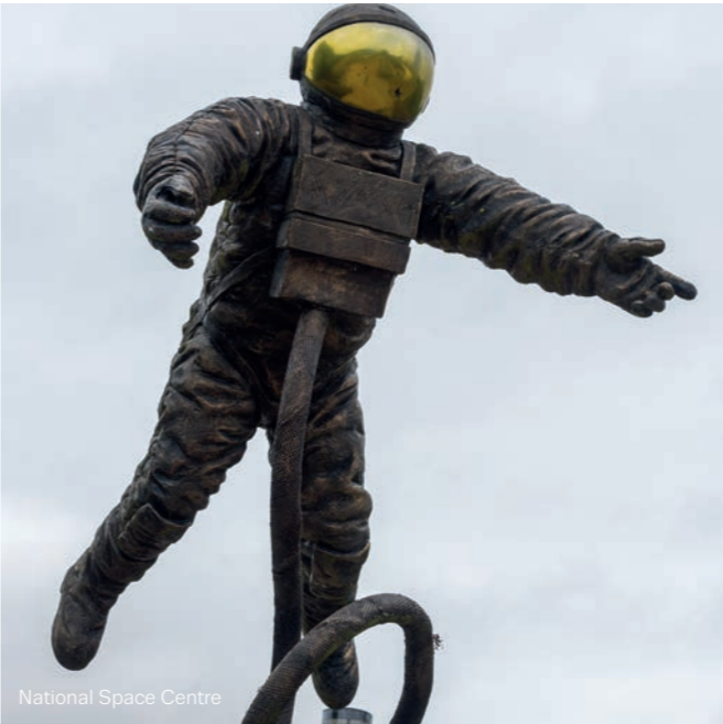
National Space Centre

With all the amenities on your doorstep – from shopping centres, salons and pubs to a farm shop, pharmacy, GPs and an excellent selection of schools – Thorpebury in the Limes has everything your family could ever need. Whether you're a couple, growing family or looking to downsize to a more peaceful location, there is something for everyone at Thorpebury.