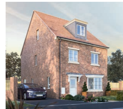
The Sherford 4-bedroom detached home