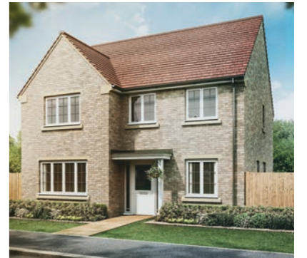
The Severn 4-bedroom detached home