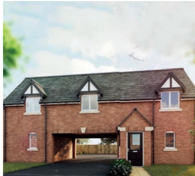
The Glen 2-bedroom home