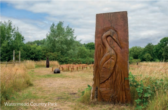
Watermead Country Park