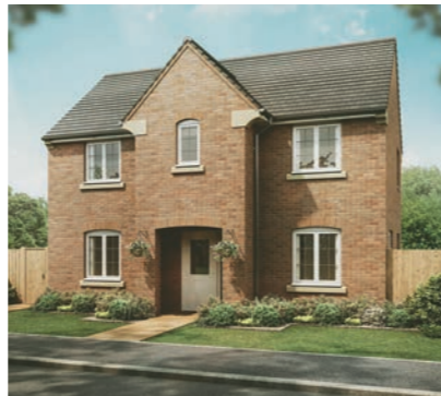
The Dee 3-bedroom home