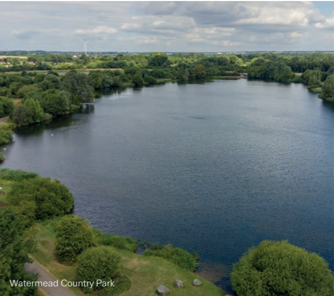
Watermead Country Park

As part of a sustainable urban extension consortium of approximately 2000 homes, our stunning new development consists of 146 plots that offer an excellent choice of 2, 3, 4 and 5-bedroom homes, all beautifully designed inside and out.