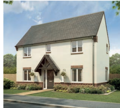
The Teme 3-bedroom home