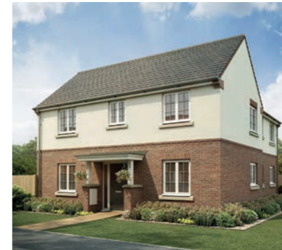
The Beamish 4-bedroom detached home