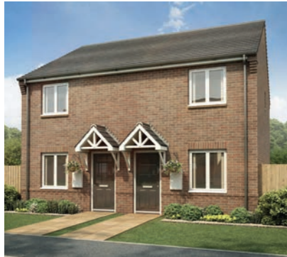
The Rother 2-bedroom home

We have 19 different house types ranging from 2 to 5-bedroom homes. Discover more details, including floor plans, specifications and virtual reality tours by hovering over the QR code with your smart phone.