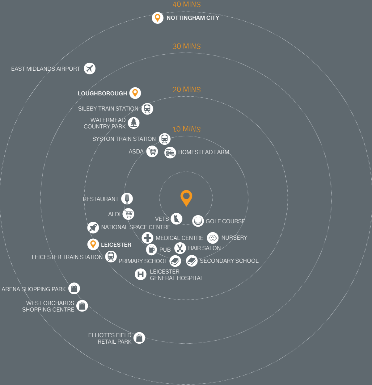
Travelling by car

Before we give you a glimpse into your new home and life at Thorpebury in the Limes, here's a quick overview of the local area and just a few of the things you can reach by hopping in the car for 40 minutes or less.