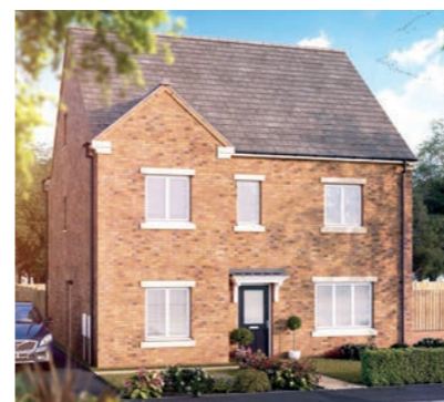
The Stonethwaite 5-bedroom detached home