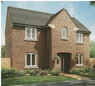
The Nene 3-bedroom home