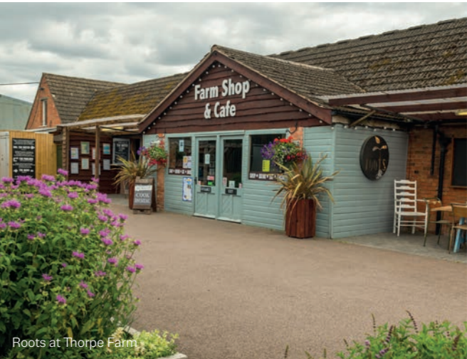
Roots at Thorpe Farm