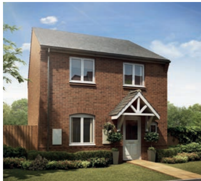
The Dove 3-bedroom home