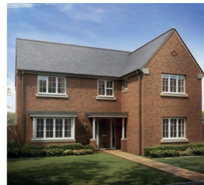
The Medway 4-bedroom detached home