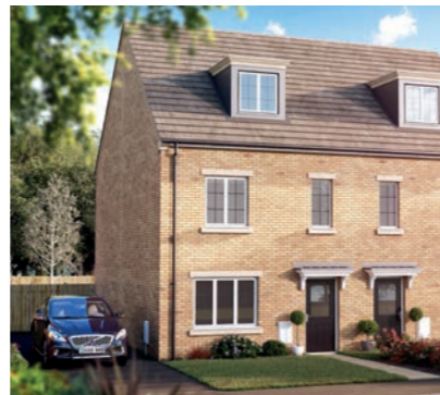
The Henmore 3-bedroom home